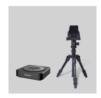
Industrial Pack (For EinScan Pro 2X 2020) Makes a static automatic scan on a tripod possible for a better accuracy.