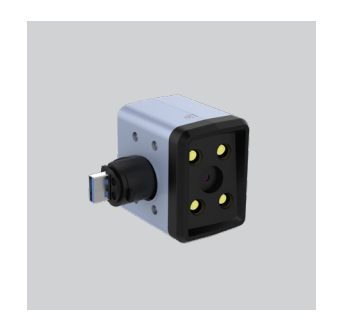
Color Pack (For EinScan Pro 2X 2020) Gets the full-color texture with geometry.